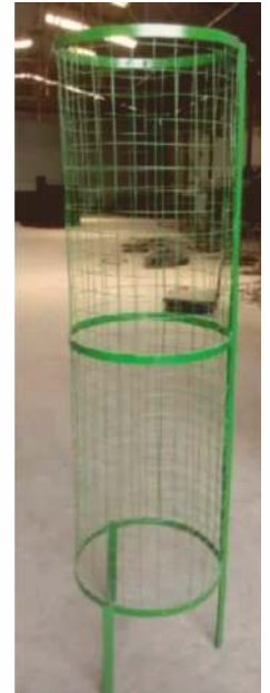
IRON FRAME TREE GUARD

Design: Round Color: Green Size: 5x6 Feet