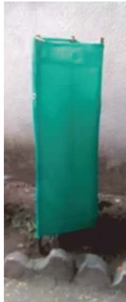
SHADE NET BAMBOO SUPPORT