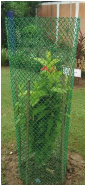
HDPE BAMBOO SUPPORT

Siddhi Plastic's Tree Guard is an ideal solution for tree protection. These unique DIY Tree Guards are used to provide protection to the small plants from animals and other unwanted harms. They meet all quality standards, are better than conventional mesh structures, and are light in weight and easy to install.