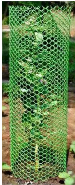
HDPE SELF STANDING