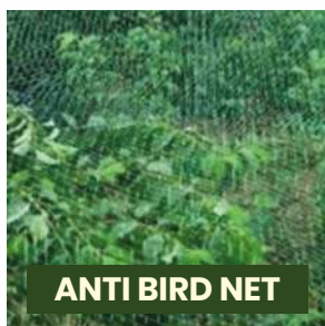
ANTI BIRD NET

FEATURES : Optimum quality Dimensionally accurate Tensile strength WIDTH : 2m/3m/50m LENGTH : 10m/20m/50 MESH : 15mm X 15mm COLOUR : Black / Green SHAPE : Diamond