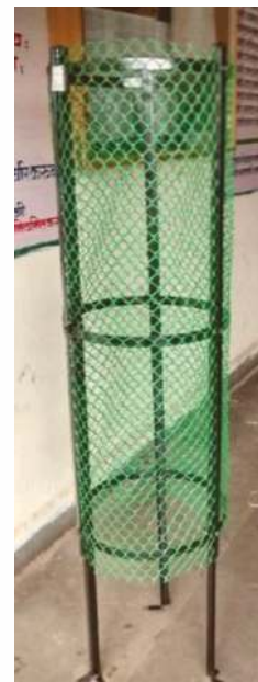
IRON FRAME HDPE TREE GUARD

Design: Round Color: Green Size: 5x6 Feet